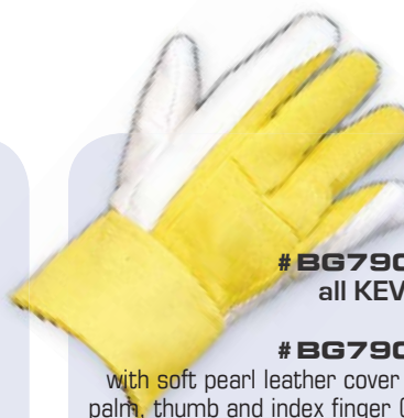
# BG790-00 all KEVLAR® 4232