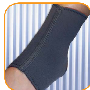
Ankle Support #TS204