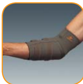
Elbow Support w/strap #TS228