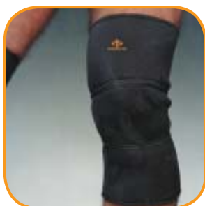
Standard knee support #TS208