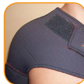
Shoulder support #TS230