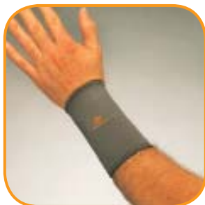
Wrist Support #TS216