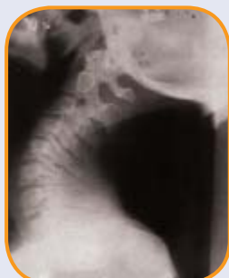
With the UPGUARD

Early X-Ray studies show what is occurring within many of the neck structures with the aid of the UPGUARD.