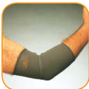
Elbow support #TS217