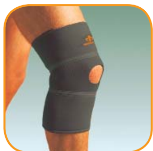
Support with cutout patella #TS209