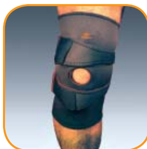
Patella tracking Stabilizer #TS866