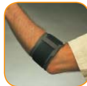
Tennis Elbow Support #TS205