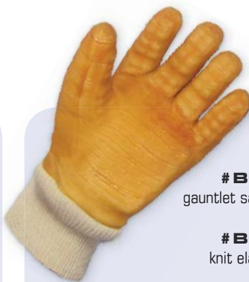
# BG620 gauntlet safety cuff