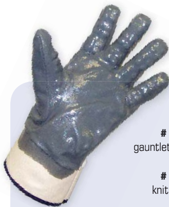
# BG600 gauntlet safety cuff