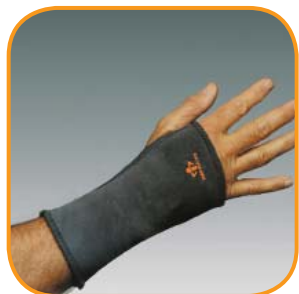
Wrist / Hand support #TS214 (LH), #TS215 (RH)