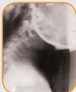
Without the UPGUARD