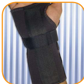
Carpal Tunnel Brace #TS242 (LH), #TS243 (RH)