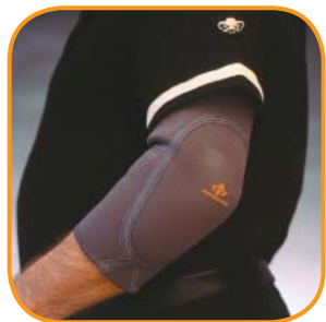
Elbow Padded #TS212